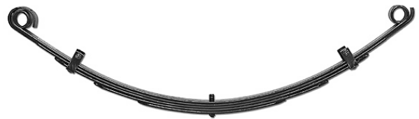
< FRAME END (MILITARY WRAP) – PHOTO 2 – SHACKLE END >