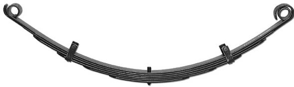
< SHACKLE END – PHOTO 6 – FRAME END (MILITARY WRAP) >

Caused by a steep drag link angle on CJ's. Installing a drop pitman arm may help.